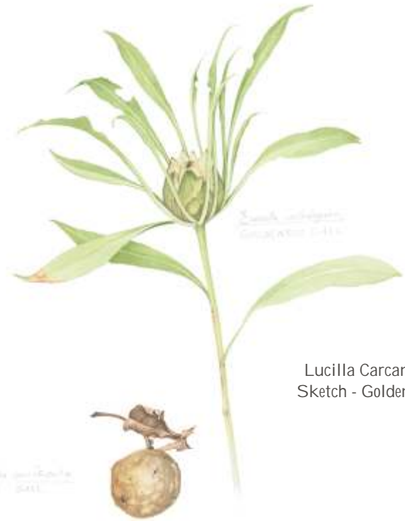
Lucilla Carcano, 2009 Sketch - Goldenrod Gall

Notification to applicants by March 31st