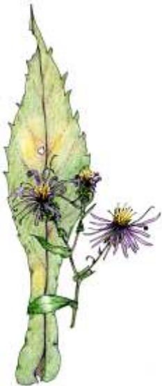
Chris Winters, 2010 Astor drawing