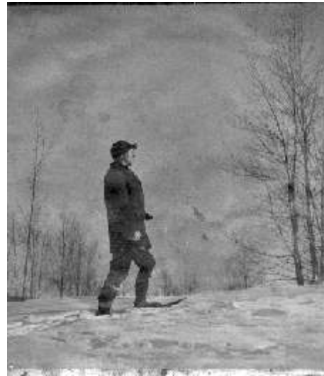
Gene Odum, February 1940.

L ong term field research has become a crucial component of studies in the biological sciences. Many scientists investigate complex questions that require years or decades of research and data collection. These studies must be conducted at sites that are protected and buffered from human disturbance. Biological field stations, like the Huyck Preserve, serve as the main resource for scientists conducting long term research. The Huyck Biological Research Station has had a strong history of high quality research spanning the last 70 years. Throughout the years, many of the projects conducted at the Huyck Biological Research Station have been significant long term studies that tackle important and complex questions. Highlighted below are just a few examples of some of the fascinating researchers and long term studies conducted at the field station.