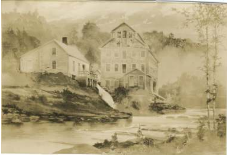
Huyck Woolen Mill, circa 1923.