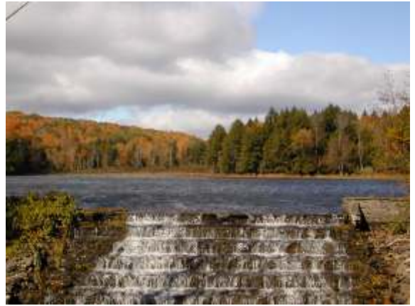
View of Lincoln Pond

Whether you've enjoyed and supported the Preserve for years, or you have only recently discovered us like the folks who became members this summer from Altamont, Delmar, New York City, Cobleskill, Troy and Albany, your generous support of this nonprofit organization makes a real difference in our ability to improve our trails, offer excellent programming, and support innovative work in the study of ecology. Thank you so much! As we enter fall (I can almost smell the cider), join us for our “ Migration Celebration ” bird festival on Saturday September 13 th , an end of summer wildflower walk the following Saturday, and enjoy the magnificent foliage throughout October. Who knows, maybe you'll see old Scarneck returning upstream to his winter hideout!