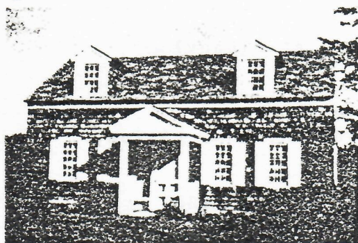
Lincoln Pond Cottage